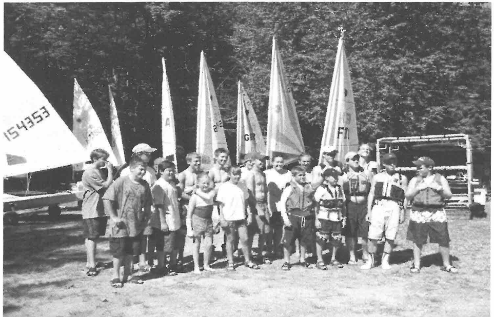
Our young sailors really enjoyed competing in last year's Youth Regatta

The LWSA stays afloat through the efforts of its volunteers, through your memberships and generous donations, through the donation and resale of used boats, and through your participation . We look forward to seeing you on the lake this season. Good sailing!